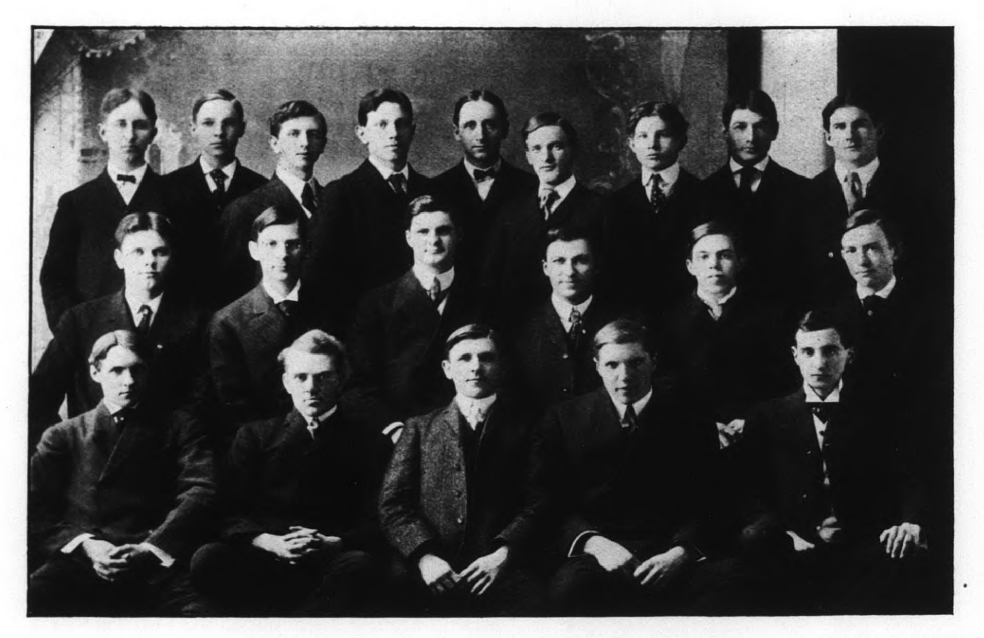
ZETA SIGMA LITERARY SOCIETY, ALMA COLLEGE, 1906.