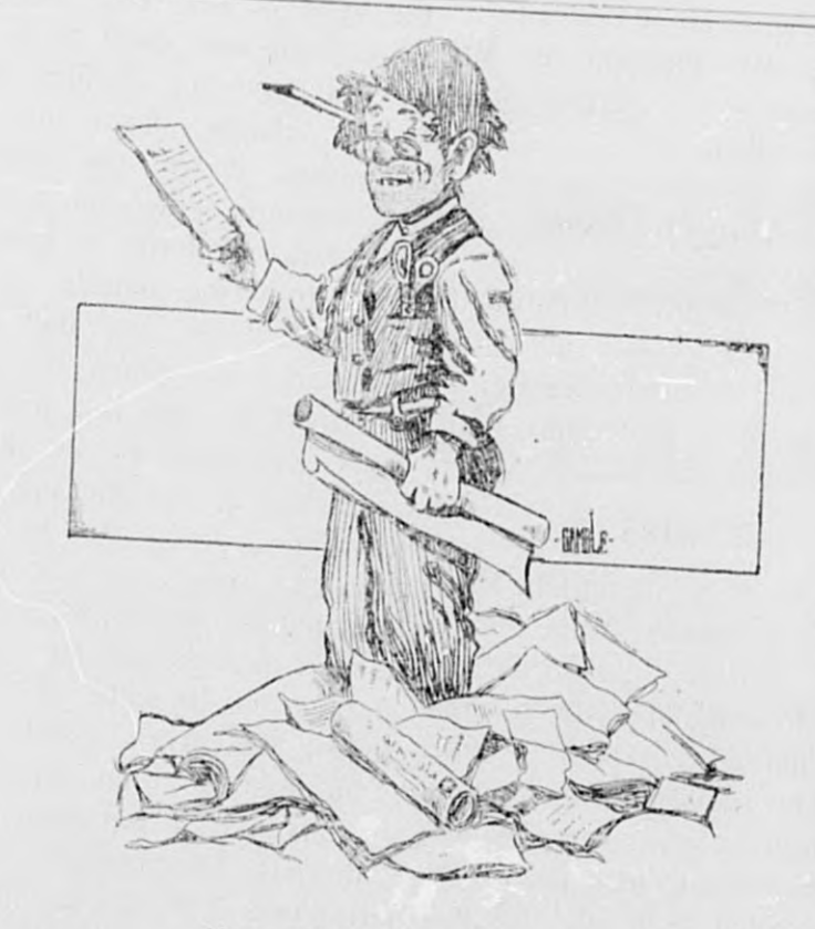
How Ab ut Next Year?

This being the "skedoo" number of the Almanian, naturally re- overtime. The best feature of the minds one that before many moons the year will be up and some one schedule is that the majority of must have the honor thrust upon them, of directing the policy of this games, and the best ones too, are estimable sheet, for the ensuing year. Who will it be? From the mere to be played on the home grounds. association of ideas it would be put sensible to conclude, that he who Consequently, the hundreds of has contributed most to the welfare of the paper this year should loyal fans will have their fill of be the logical candidate for managing editor next year. Judging by good exciting games. Besides the the vast amount of copy submitted during the past year, it could be intercollegiate games for the chamtruthfully stated that there wouldn't be such an awful scramble of pionship some of the practice candidates, were such the determining factor. For all practicable pur- games promise to be of the best. poses, so far the interest manifested, outside of the staff itself, has not. The large number of practice games been anything marvelous. The conclusion would be then that he, who, secured, will be a great assist and from now on, makes himself most useful to the Almanian, by submit- by the time the intercollegiate ting copy and helping things along in general, should receive considera- meet rolls around we should be ion as a candidate for the office of minaging editor for 1909-10.