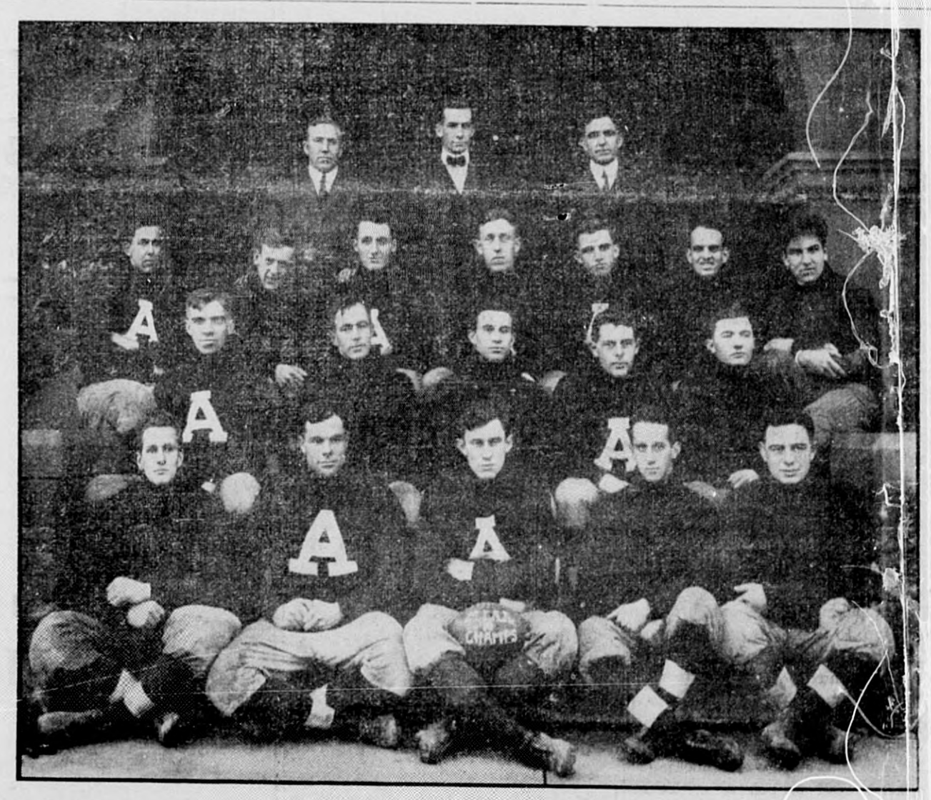
The Men Who Did It