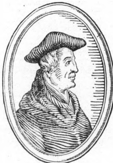
ROGER BACON 1214-1294

English philosopher and man of science. Studied at Oxford and the University of Paris. Wrote the Opus Majus , Opus Minus , Opus Tertium , and many other treatises.