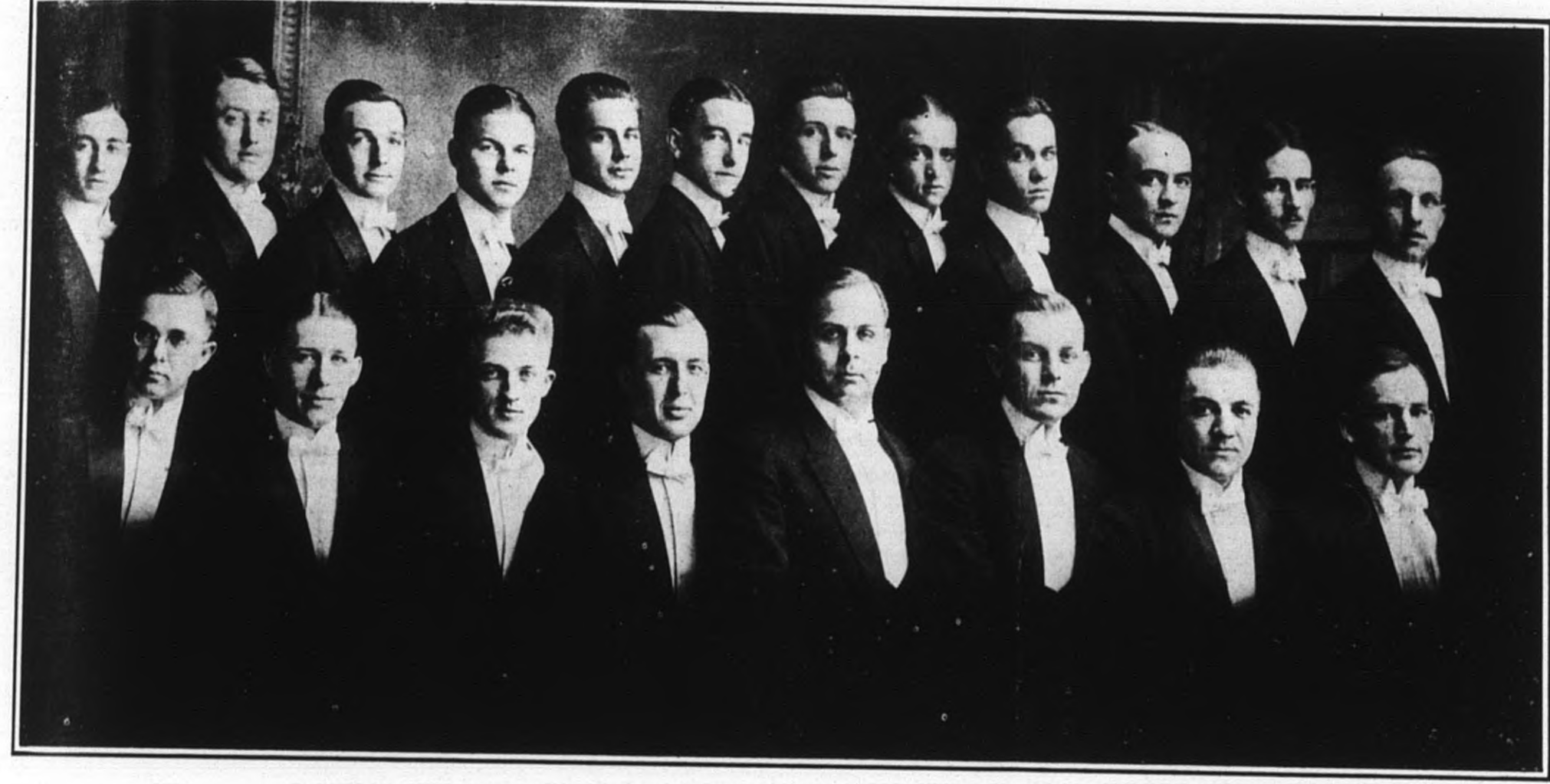
BIGGEST MUSICAL ORGANIZATION OF KIND AT COLLEGE GETS LONGEST TRIP

The Alma college glee club is rap- | tion of any kind, the annual spring | Wednesday, April 6-Bay City.