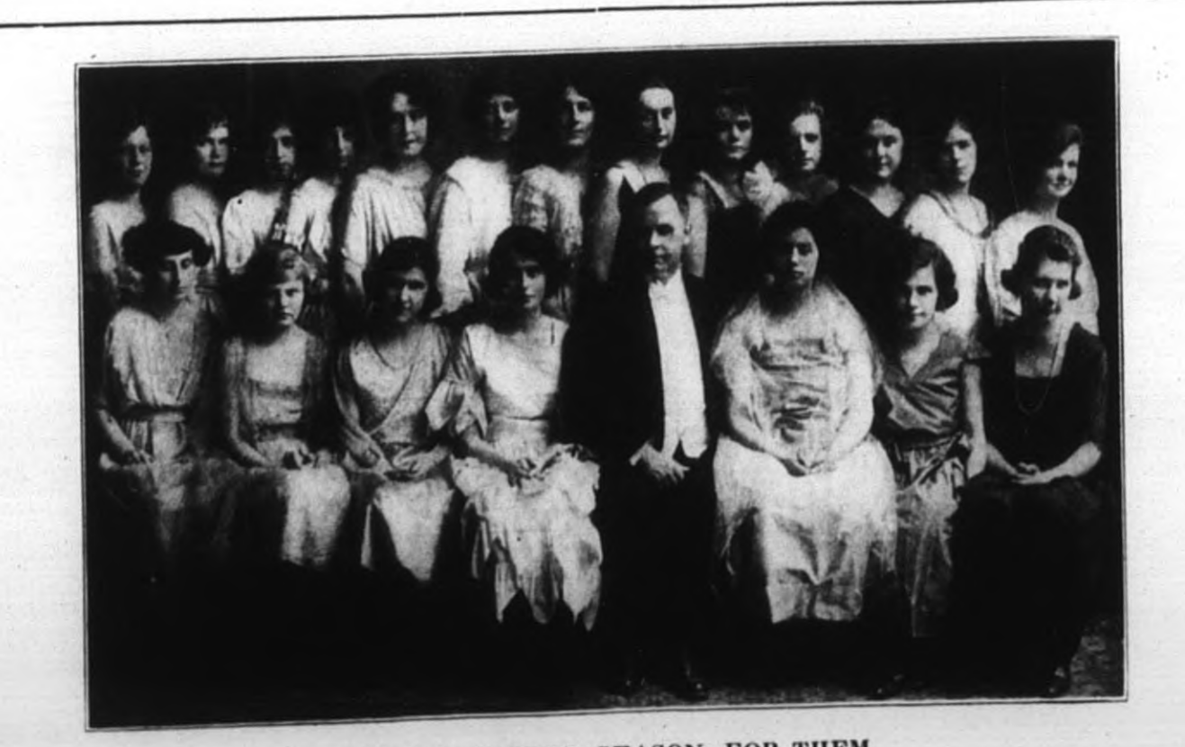
SPREAD CLOSES SEASON FOR THEM

The work of these students fur-Another feature of the program for and cozy groups were chatting to- are included in this Maroon and nished a well balanced musical entercommencement will be the baccalau- gether, some impromptu stunts and Cream. Especially notable will be the tainment for the evening, and was reate address on Sunday evening, impersonations were enacted. The cartoon and illustrating work. The greatly enjoyed by the audience. It is a tribute to the diligent work of the pupils and to the excellence of their instructors that they should perform so capably. It is only another indication that the music department of the college, though doing its work quietly, is doing it thoroughly and well.