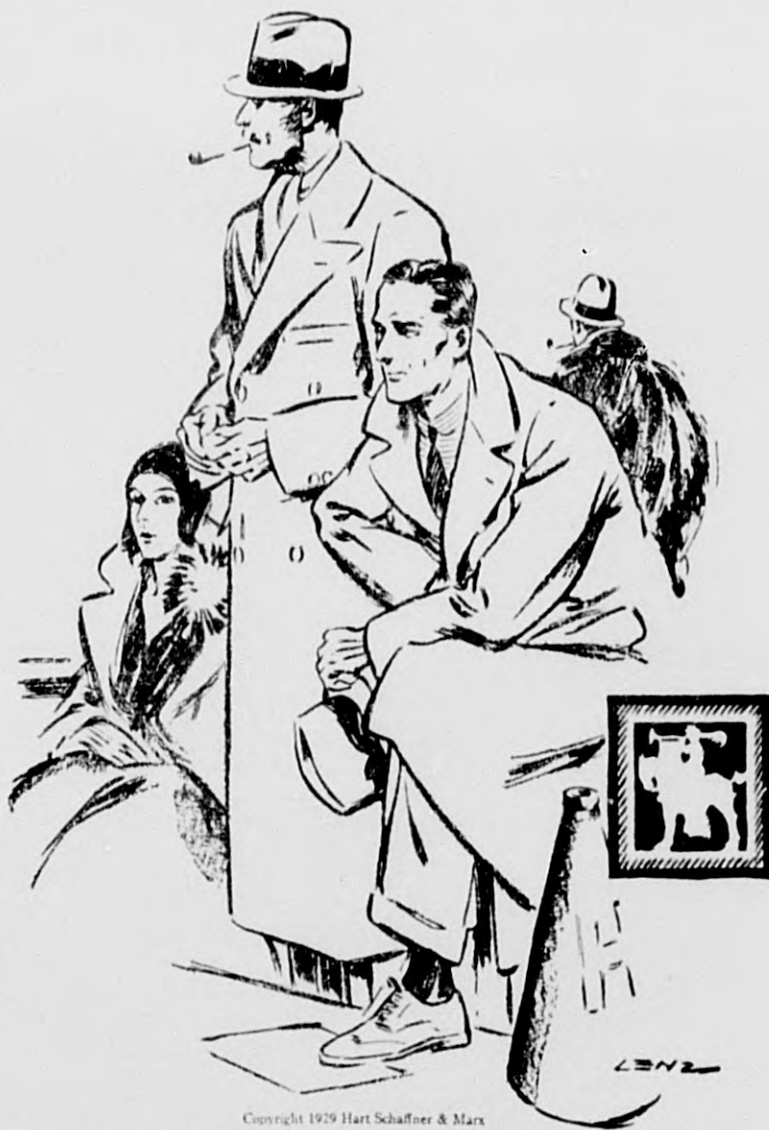
Copyright 1929 Hart Schaffner & Marx

We've scored again with Hart Schaffner & Marx Jason Fleece Overcoats