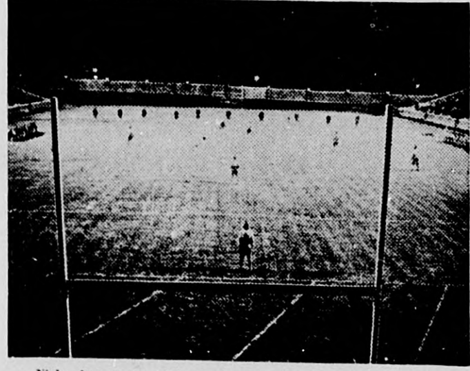
Night photograph of Temple Stadium, Philadelphia, Pennsylvania, floodlighted with G-E projectors

Other college men in the General Electric organization have specialized in street-