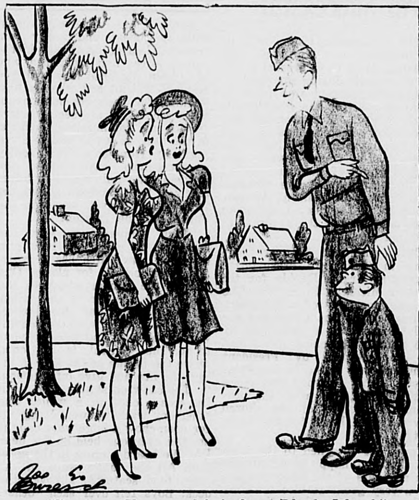
"I'm from Texas and he's from Rhode Island."