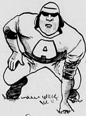
GAME 2:00 P.M.