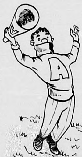
FRIDAY — P.E.P. Meetings 8:00 P.M.