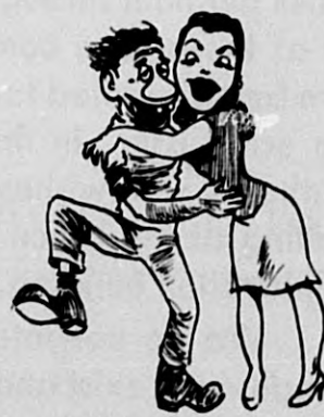
INFORMAL DANCE 9:00 P.M.