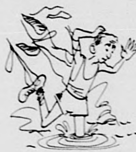
"X" COUNTRY 11:30 AM