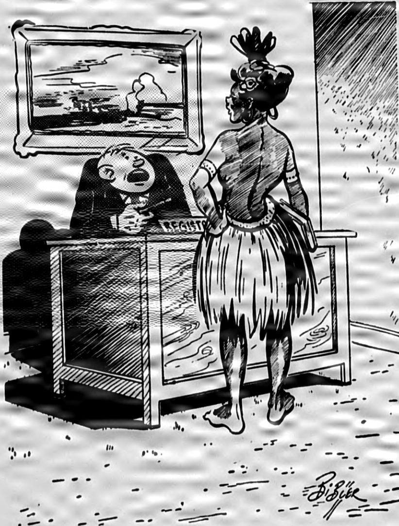
"Here we allow foreign students to wear the costume of their choice — however, in your case, Miss Boom Boom, we feel —"