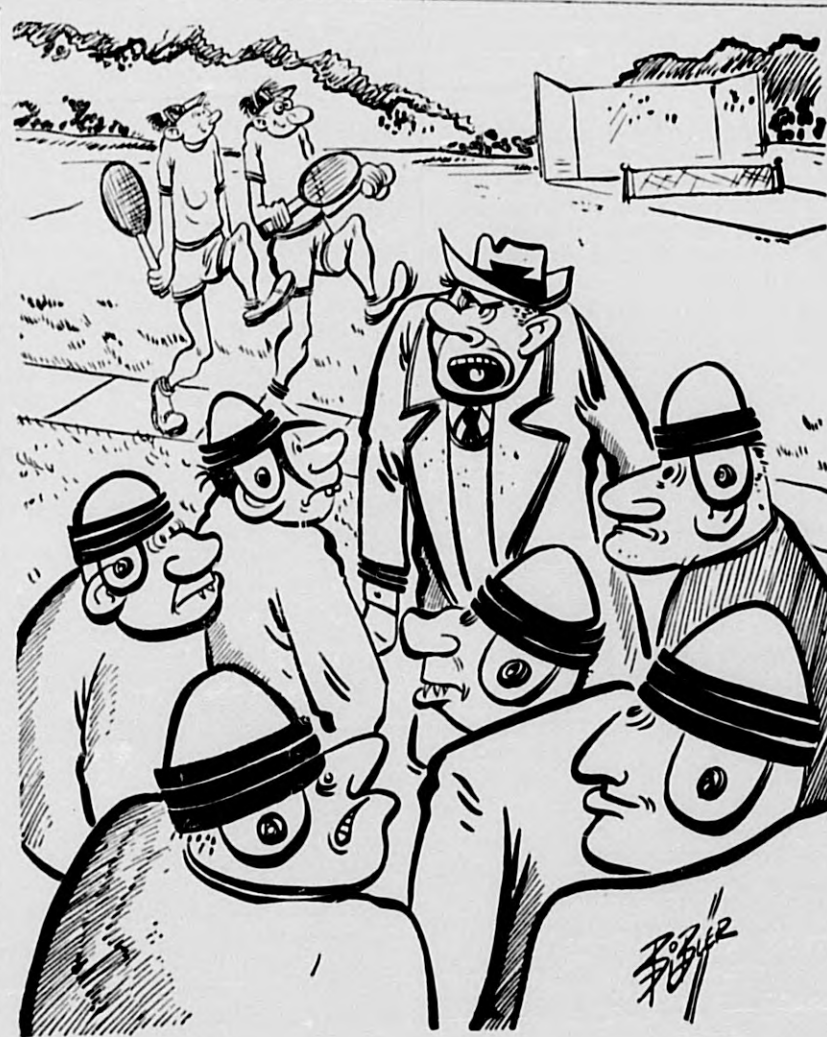
"O. K. men, let's watch your language — here comes a coupe of tennis players."

In that track meet at Detroit on Saturday, Titan Bill Haley turned in a :10.1 100 yard dash against a 30 mile wind.