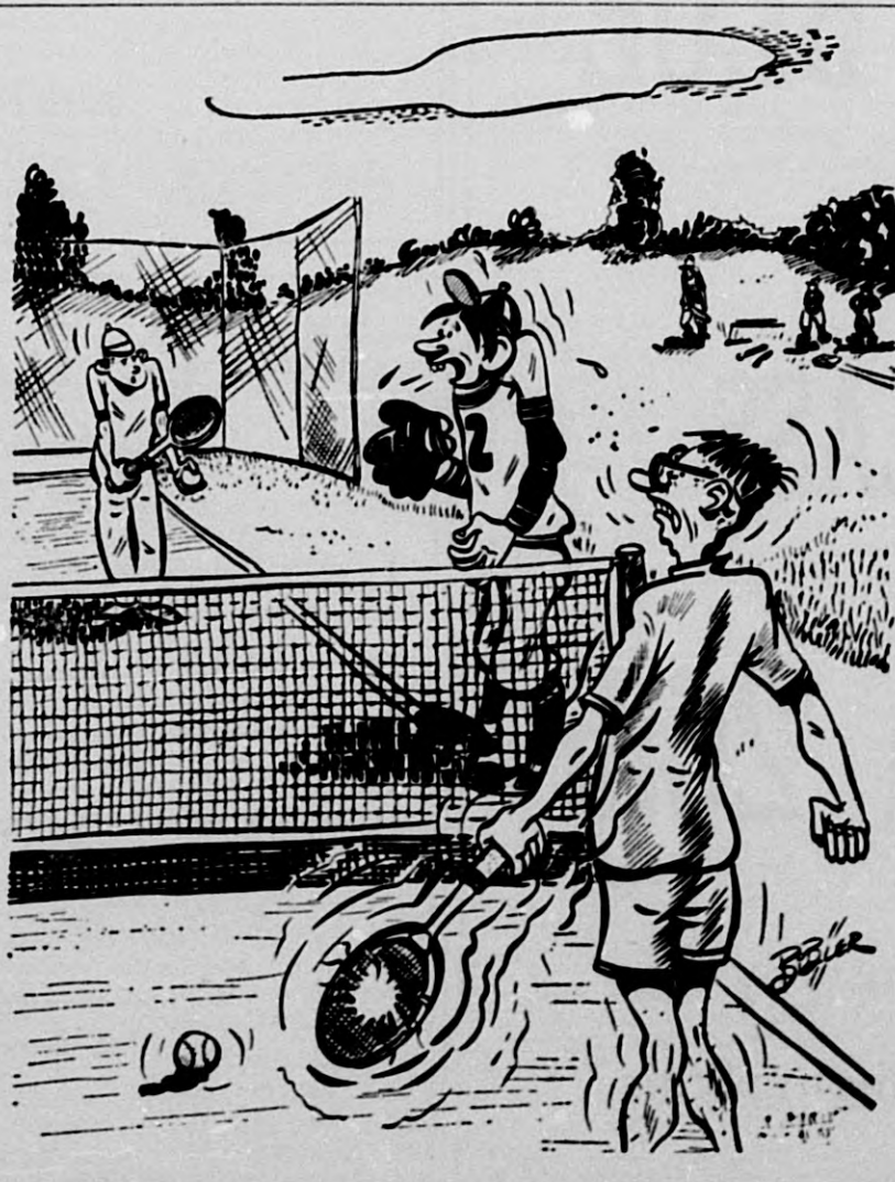
"Say, did you fellas see anything of a baseball that came over this way?"

Man comes into this world without his consent, and leaves it against his will. When he is little the big girls kiss him, and when he is big the little girls kiss him. If he is active in politics, it is for graft; if he is not interested in politics, he is no good to his country. If he makes a lot of money, he is dishonest; if he is poor, he is a bad manager. If he needs credit, he can't get it; if he is prosperous, everyone wants to do something for him. If he is religious, he is a hyprocrite; if he religious, he is a hyprocrite; if he doesn't go to the Temple, he is a hardened sinner. If he gives to charity, it is for show; if he does n't, he is a stingy cuss. If he is affectionate, he is a soft speciman; if he doesn't care for anyone, he is doesn't care for anyone, he lead of this term. holders considered representative if he doesn't care for anyone, he end of this term. is coldhearted. If he dies young, gree and go to work, according there was a great future before to the survey, here is what you him; if he lives to a ripe old age, he missed his calling. If he saves money, he is a tightwad; if he spends it, he is a spendthrift. If lary of about $4,500 a year. he has money, he is a grafter; if You will own your own home he hasn't got it, he's a bum. So which will have six rooms and a what's the use?-Author unknown.