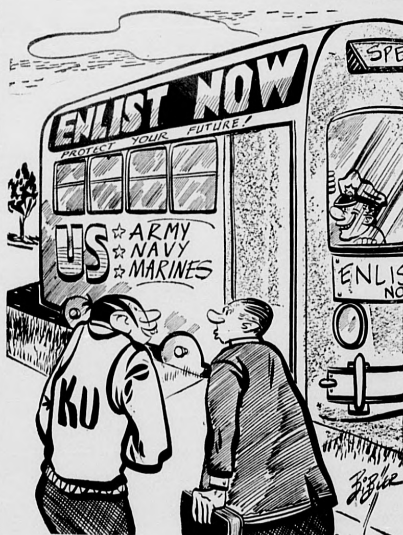
"They always show up around finals time."