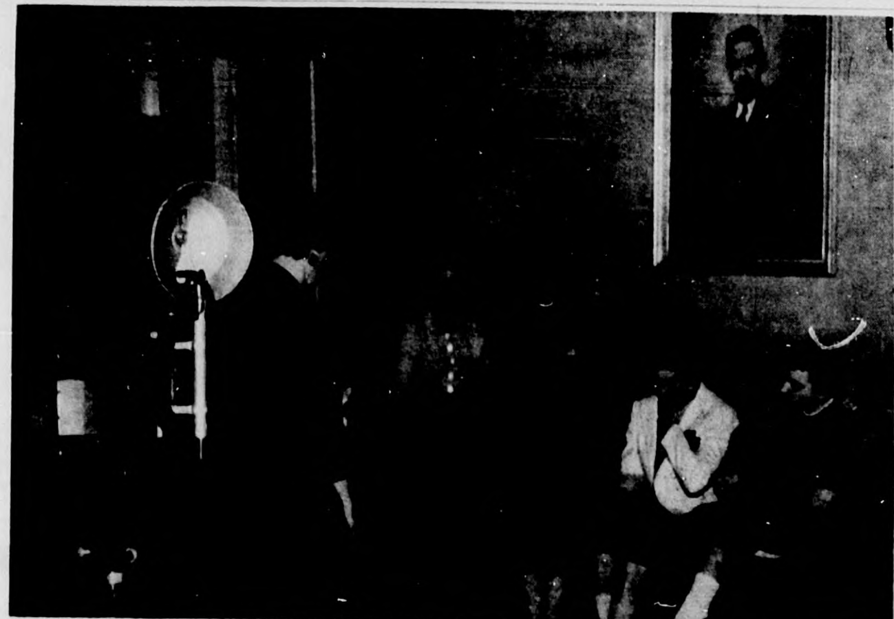
GRAB YOUR PROP! Deeply engrossed in the process of taking pictures for the Scotsman, the Almanian photographer was hardly noticed "What do you want for a prop?" one student was asked. "Kim Novak will do." was the reply.