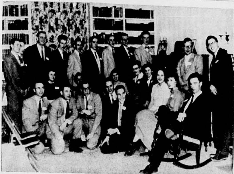
New and returning students, shown above, gathered Sunday night at the president's home for an informal supper and orientation period.