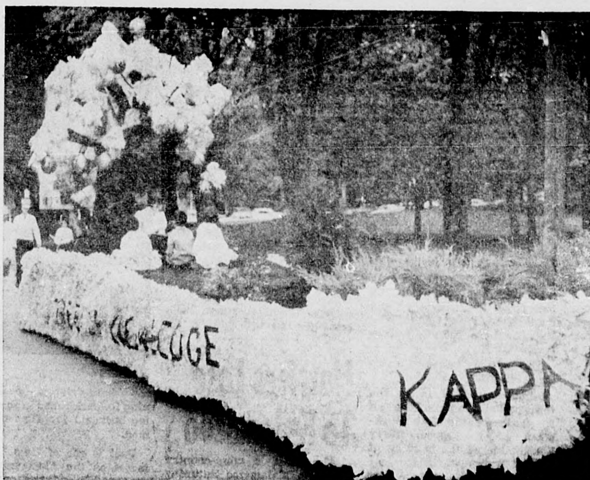
Winning float in last Saturday's Homecoming parade was "The Tree of Knowledge," the entry by Kappa Iota sorority.

Well, when you hear an oath like that I guess you have to believe the kid. I helped him lug his tool kit to the steps of Wright Hall and walked down Superior Street looking for the masked man.