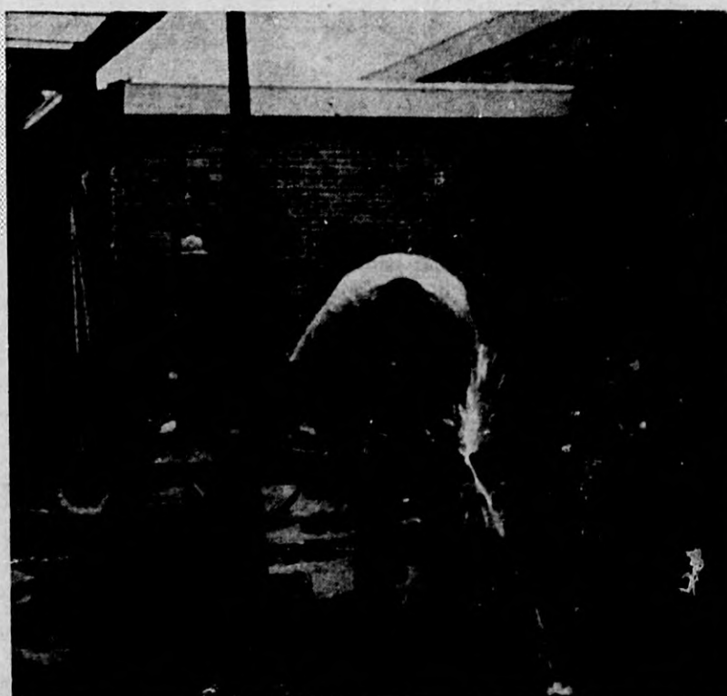
Working on the addition to Van Dusen Commons. See story under picture at the top of the page.

New rules for weekday "per" will not change the 9 p.m. regulation for those on academic probation or for incoming (continued on page 4)