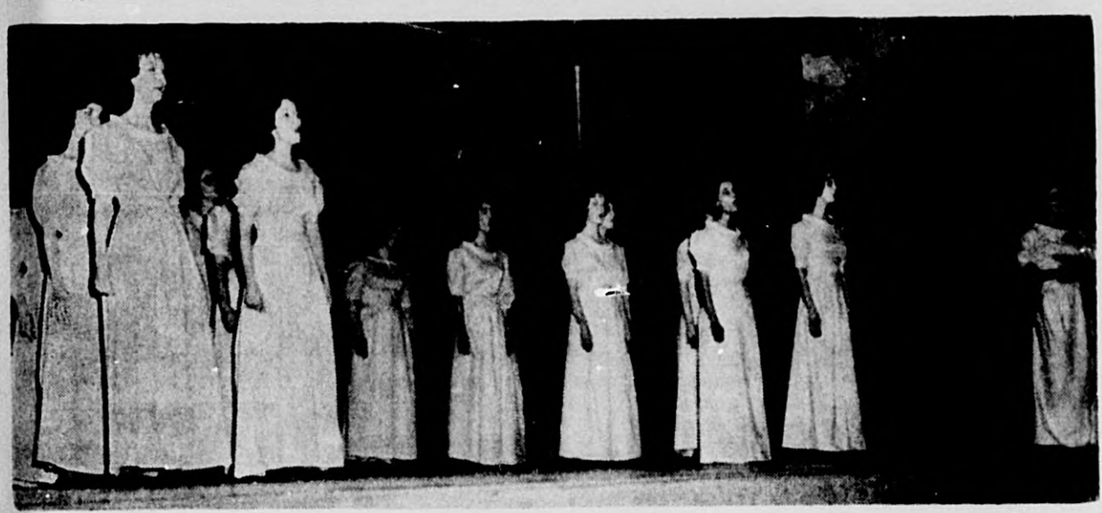
Caught in song in depicting "The Life of a Woman" are the KIs, who won second place in the Song Fest.