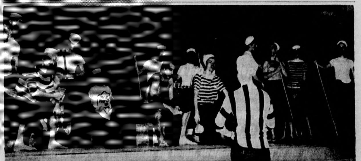
How can so many people smile and sing at the same time? They (the Tekes) look somewhat like sixteen former Miss Americas with hair on their chest. This picture was taken at last Saturday's Song Fest.

This is the first public exhibit of a display designed to show a dimension of beauty as seen through the eyes of the researcher working with the latest wonder tools that extend his sight. The exhibit will be one of several that will be viewed by high school science students at the Alma College High School Science Day, Saturday.