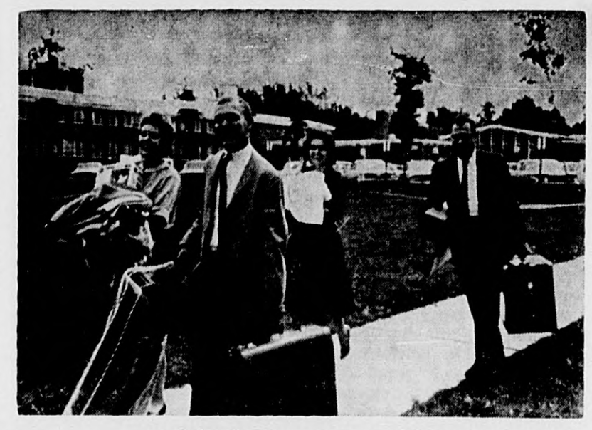
... and the frosh came marching in!

Sunday through Thursday 4 p.m.-1 a.m. Friday and Saturday 4 p.m.-2 a.m. DELIVERIES