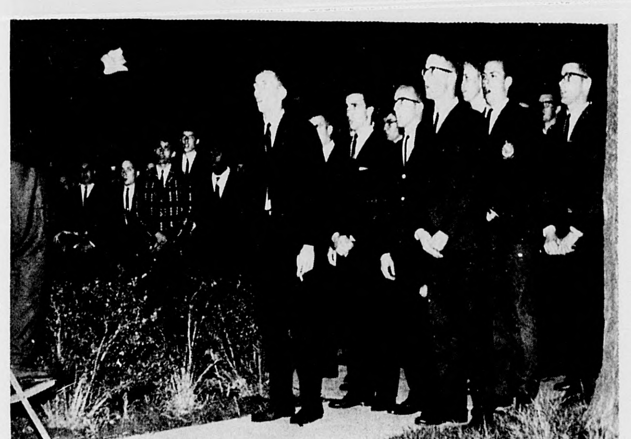
"Sing Along With . . ." The Tekes practicing for serenade night.