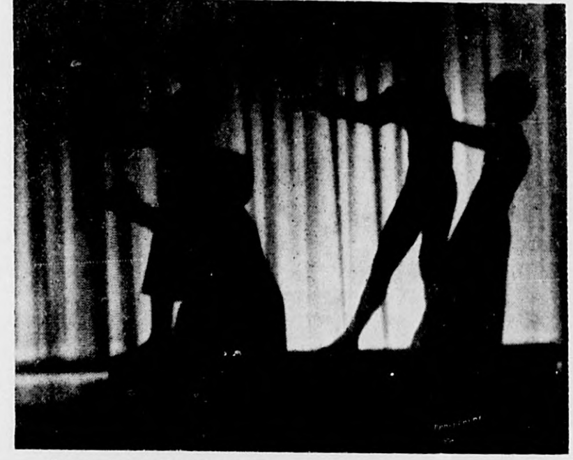
Scene from "Go Down Moses," a modern dance presentation by Orchesis at their annual concert last weekend.