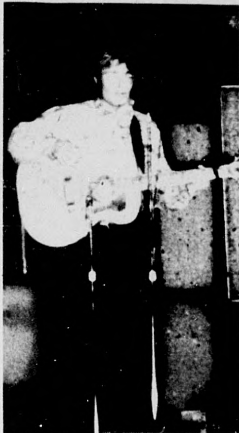
Shown above is John Denver, the walkaway hit of Friday night's performance.

There is no space here to fully analyze the war. However, it is not a senseless or mad mistake. The war exists because the American rich have huge interests to protect in Vietnam and Southeast Asia, both present and potential investments to protect and acquire. Negotiations are simply an attempt to make a deal and continue imperialism without waging a war. This is what the rich want. When the Moratorium Committee calls the war senseless and madness and asks for negotiations, they essentially express the same desire--peaceful imperialism. The Vietnamese people have fought a long time against western imperialism. People in America must realize and condemn this imperialism to effectively oppose the war.