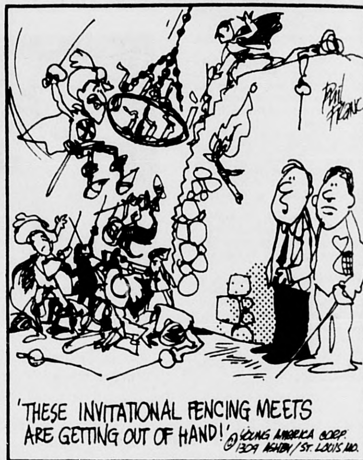
'THESE INVITATIONAL FENCING MEETS ARE GETTING OUT OF HAND!' © YOUNG AMERICA CORP. 1309 ASHBY / ST. LOUIS, MO.