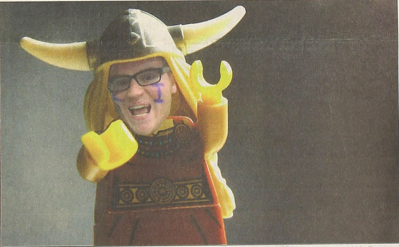
Meerkat Enthusiast: Campus Rabble-Rouser