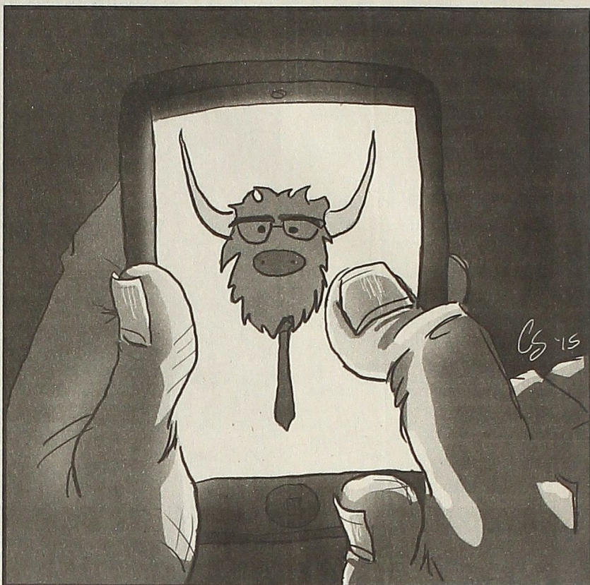
Emmy Nems: Creation Maker

“Yik Yak has the potential to turn into an online bullying forum due to its anonymity,” she explains. “Bullying has deep and broad negative psychological im-