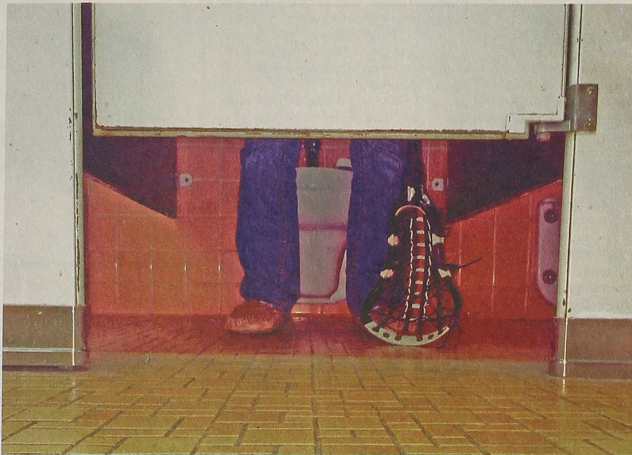
A women's lacrosse player caught with her stick in the bathroom.

"It really is the most stressful part about playing lacrosse